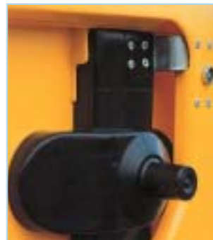
Lid lock integrated into the hinge

Once a yellow bag is placed in an OTTO Clinical Waste Container and the lid lock snaps shut, it need not be handled again. The container is secure and mobile, from ward or surgery to the incinerator – no secondary handling. A closed cycle in the fullest sense.