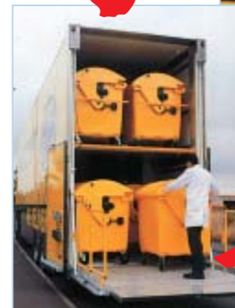
Safely sealed containers are transported to the incinerator site