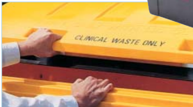
Lid designed to avoid trapped fingers