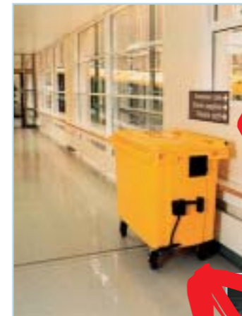
660 litre containers at ward