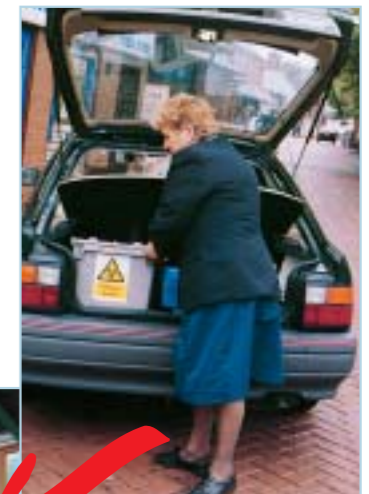
Secure attached lid containers can be used for home visits