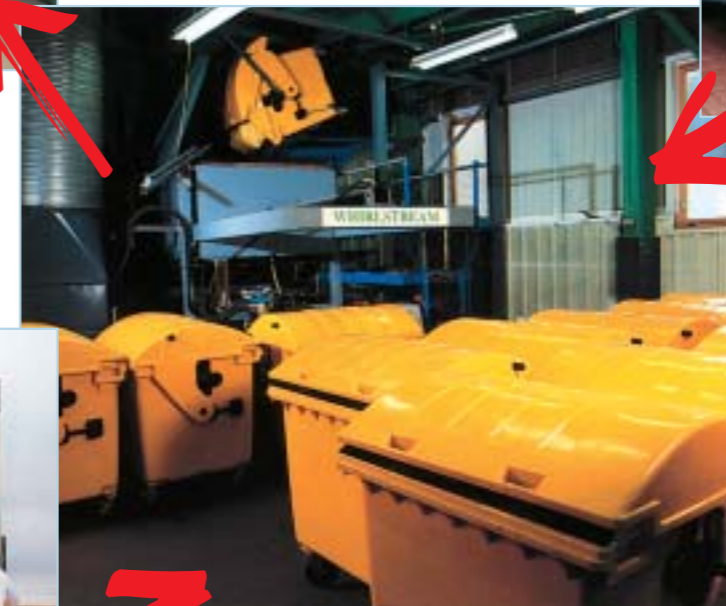
1100 litre containers emptying directly into the incinerator hopper