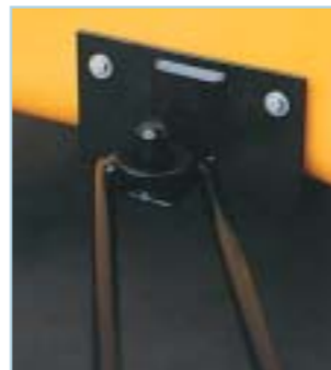
Durable towing bracket